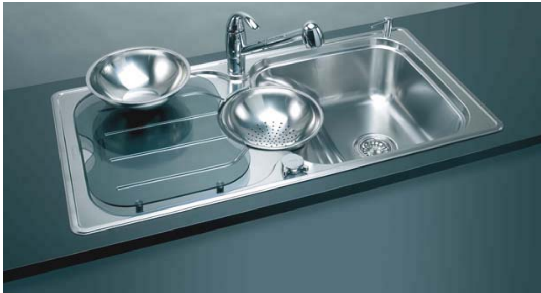
Attractive and multi-functional – the sink "Franke Beach"